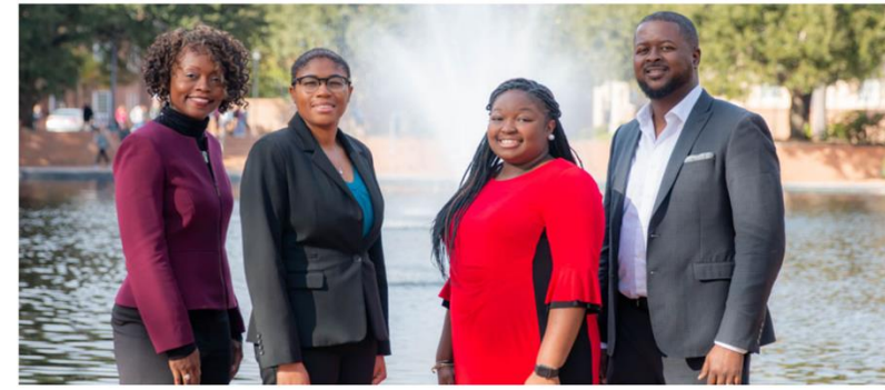
2020 social justice award winners

Faculty, staff, student honored for community service