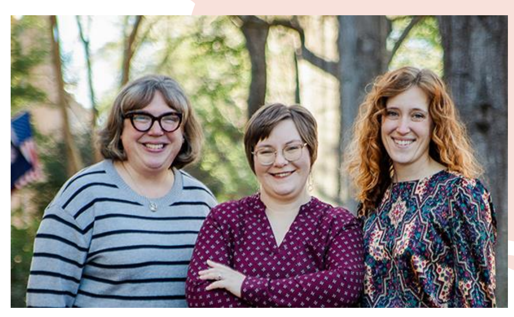
We're National Fellowships, of National Fellowships and Scholar Programs. Find us on the third floor of DeSaussure!